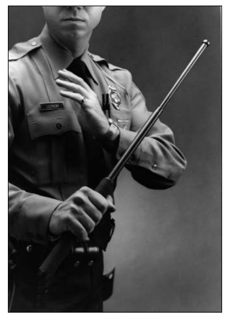
ALWAYS READY—The finest baton is of little value if not available when you need it. In its collapsed configuration the ASP Tactical Baton is always readily available. When expanded the ASP presents the greatest psychological deterrence of any intermediate force weapon.

other markets do you target? Military? Security? Self-defense?