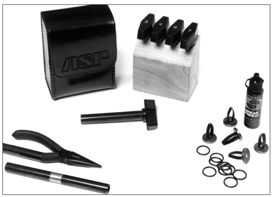
MAINTENANCE KITS—Armament Systems and Procedures offers a complete selection of maintenance kits for adjustment and repair of the ASP Expandable Baton. The Armorers, Field and Technician's Kits contain spring adjustment tubes. The repair kit provides replacement O-rings, retaining springs and lubricant for ongoing maintenance of batons. All kits are encased in leather carriers.

The concept of expandable batons came from the Orient. However, the Pending Patents on the ASP relate to the method of manufacture and the configuration of the weapon. That was something that I came up with employing technology that has not previously been utilized with intermediate weapons. It took almost ten years to find the proper combination of materials and construction methods. However, the result is a