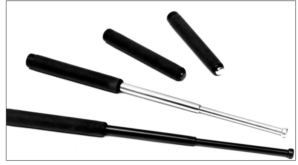
T21 —An eight inch 21" expandable baton with textured steel grip. Satin chrome or black chrome shafts are held in place by an ordnance quality spring and O-ring sealed cap.

At this point it is extremely difficult to maintain a list of agencies using the baton since there are over 300 departments that have issued the