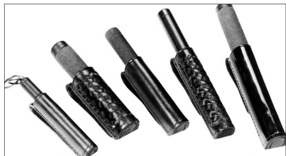
LEATHER SCABBARDS —ASP cases are constructed from premium shoulder leather which is corner stitched with nylon cord on specially modified harness machines. Scabbards feature a recessed one-direction snap and are available in Cordovan or black, plain or basketweave and high luster ASPtec.

10. Is the general public purchasing the baton as an item of personal