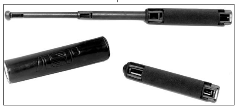
CUTAWAY BATONS—Cutaway F16, F21 and F26 batons illustrate mechanical operation and function of the ASP Tactical Batons.

Many agencies find that they want an extremely low profile image for their officers. It's only during a confrontation that they want to send a "message" to the subject they're trying to control. One of the greatest "complaints" that have been received from agencies that have adopted the baton has been the lack of an opportunity to "test" the weapon in real life confrontations. Agencies increasingly report that once the baton is opened, it has the same effect of an officer racking a shotgun. Often the subject does not know what the weapon is;